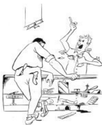
The hobby shop owner