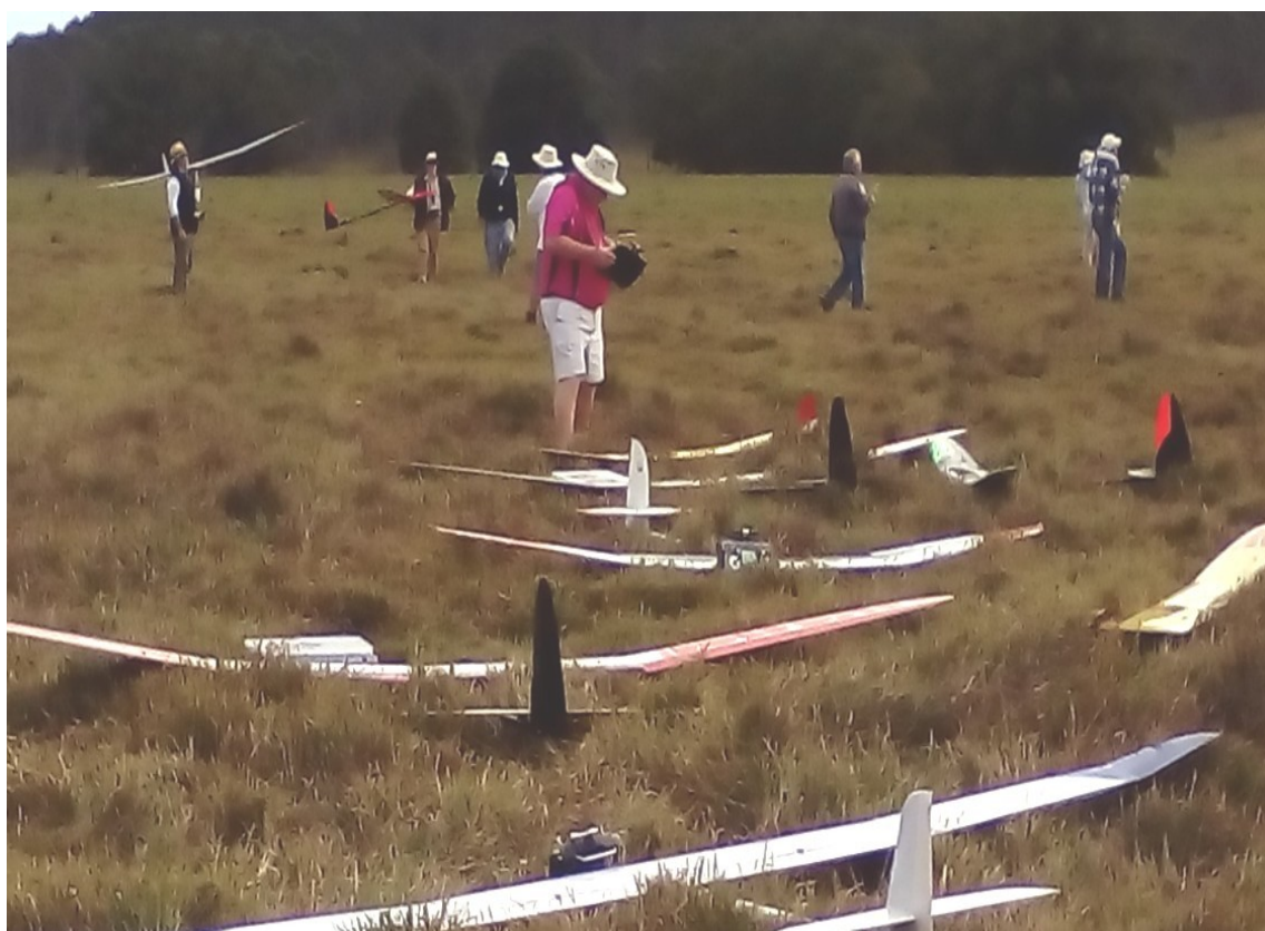
The end of another round at Pearce's Creek State of Origin glider comp.

Although only on hand as visitors, we are indebted to the wives and family members who stepped in to run the catering, largely because of the lack of LMFC volunteers.