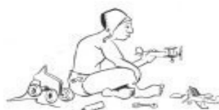
His in laws