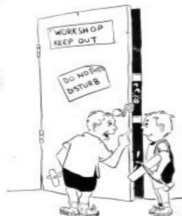
The neighbourhood kids