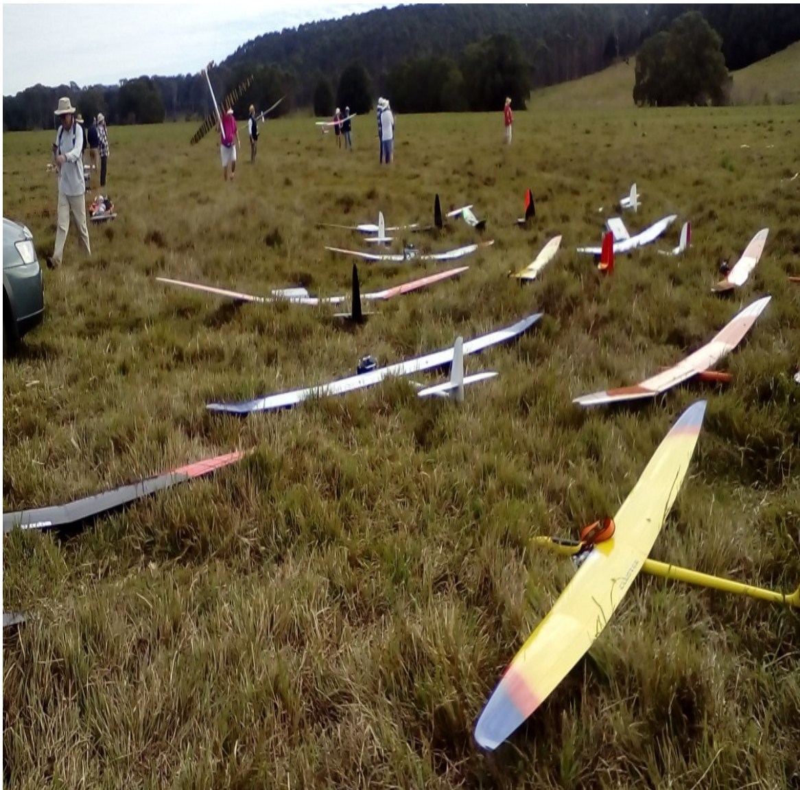
The State of Origin glider competition. Pearce's Creek pits.